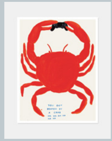
You Got Beaten By A Crab by David Shrigley shrigshop.com